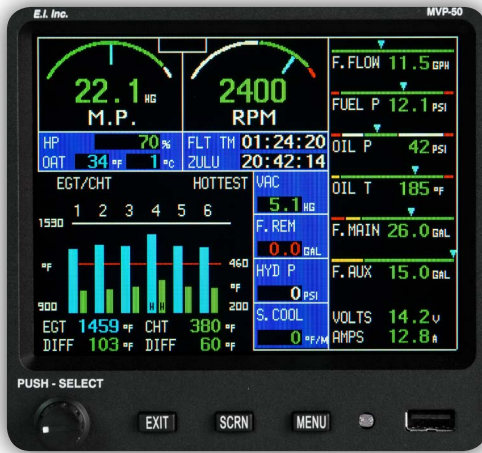
5.52" x 5.16"