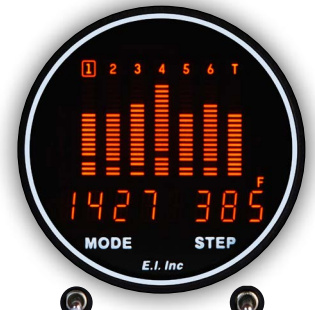
2 1/4" Dia