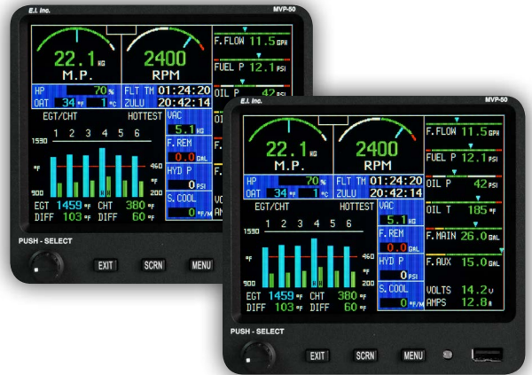
5.52" x 5.16"

CGR-30P Twin Pkg Primary Replacement (STC'd/TSO'd) 4-CYL $1,000 6-CYL $1,200