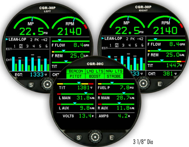
3 1/8" Dia

CGR-30P Twin Pkg Primary Replacement (STC'd/TSO'd) 4-CYL $1,000 6-CYL $1,200