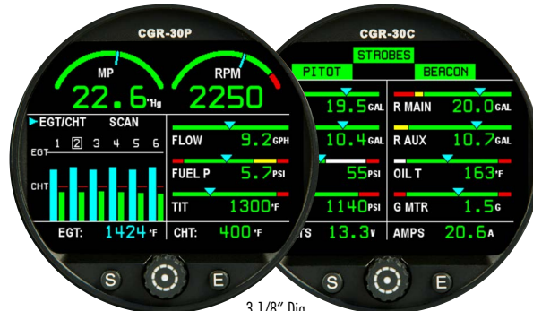
3 1/8" Dia