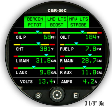
3 1/8" Dia