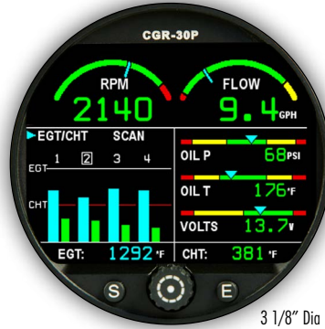
3 1/8" Dia