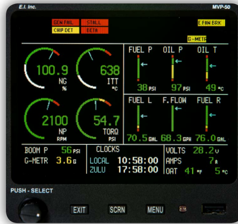
5.52" x 5.16"