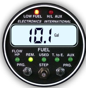
2 1/4" Dia